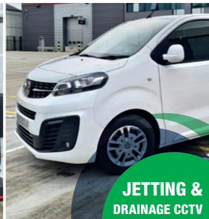
JETTING & DRAINAGE CCTV